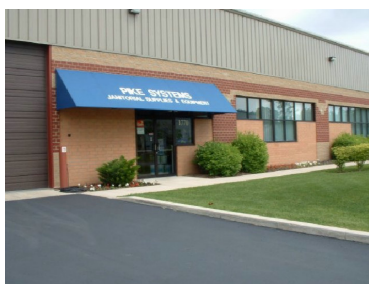
Pike Systems, Inc.